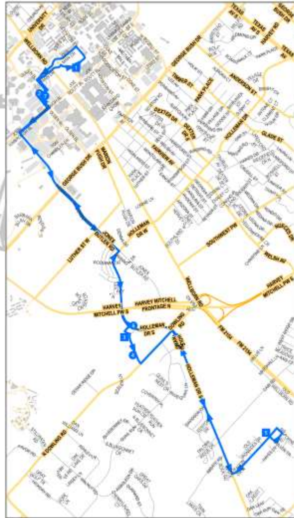
Route 40 Fall 2016